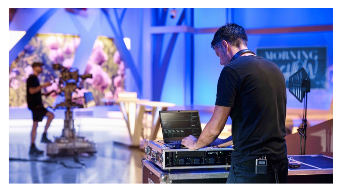
Spectera is an ecosystem that will be constantly expanded; for broadcasters, ST 2110 implementation is planned

Spectera will evolve over time with continuous hardware, software, feature and service enhancements. On the hardware side, the next addition will be the SKM handheld transmitter. Regarding features, the implementation of the SMPTE ST 2110 family of standards for the transmission of professional media signals is planned which, in the meantime, can be achieved with Merging Technologies' Hapi.